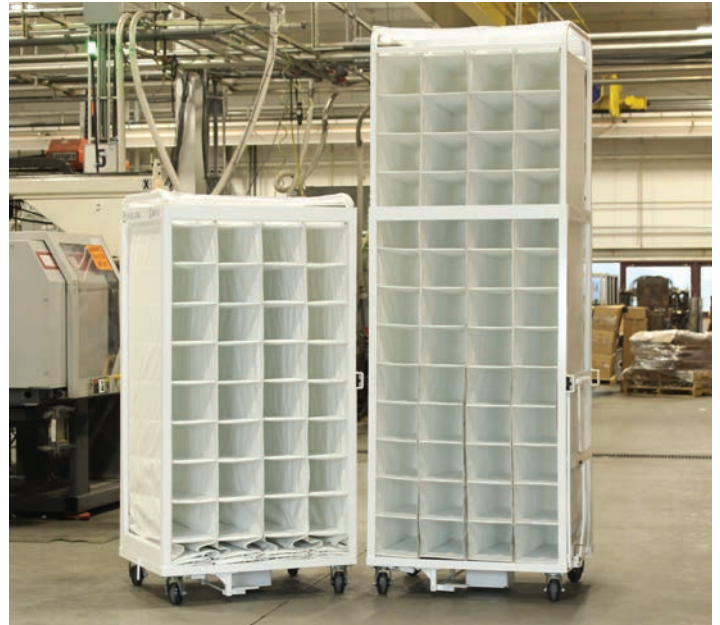
RZR Rack in lowered position (left) and RZR Rack raised to full storage capacity (right).

RZR Rack effortlessly expands vertically to increase capacity and to allow for easier loading/unloading, while also reducing your plant's floor space requirements. It's state-of-the-art design creates an all-in-one solution that can be tailored to your specifications with a variety of available options.